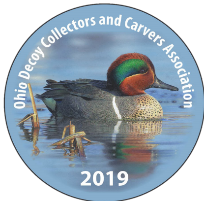
Show button designed by Adam Grimm, winner of the 2018 Flat Art Contest