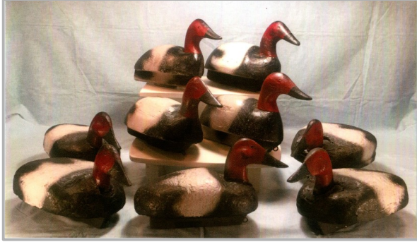
Nine canvasback decoys from the Canvasback Hunting Club near the Marblehead Peninsula in Ohio.

The history of the Canvasback Hunting Club and its connection to the Ohio Decoy Collectors and Carvers Association is very interesting to collectors.